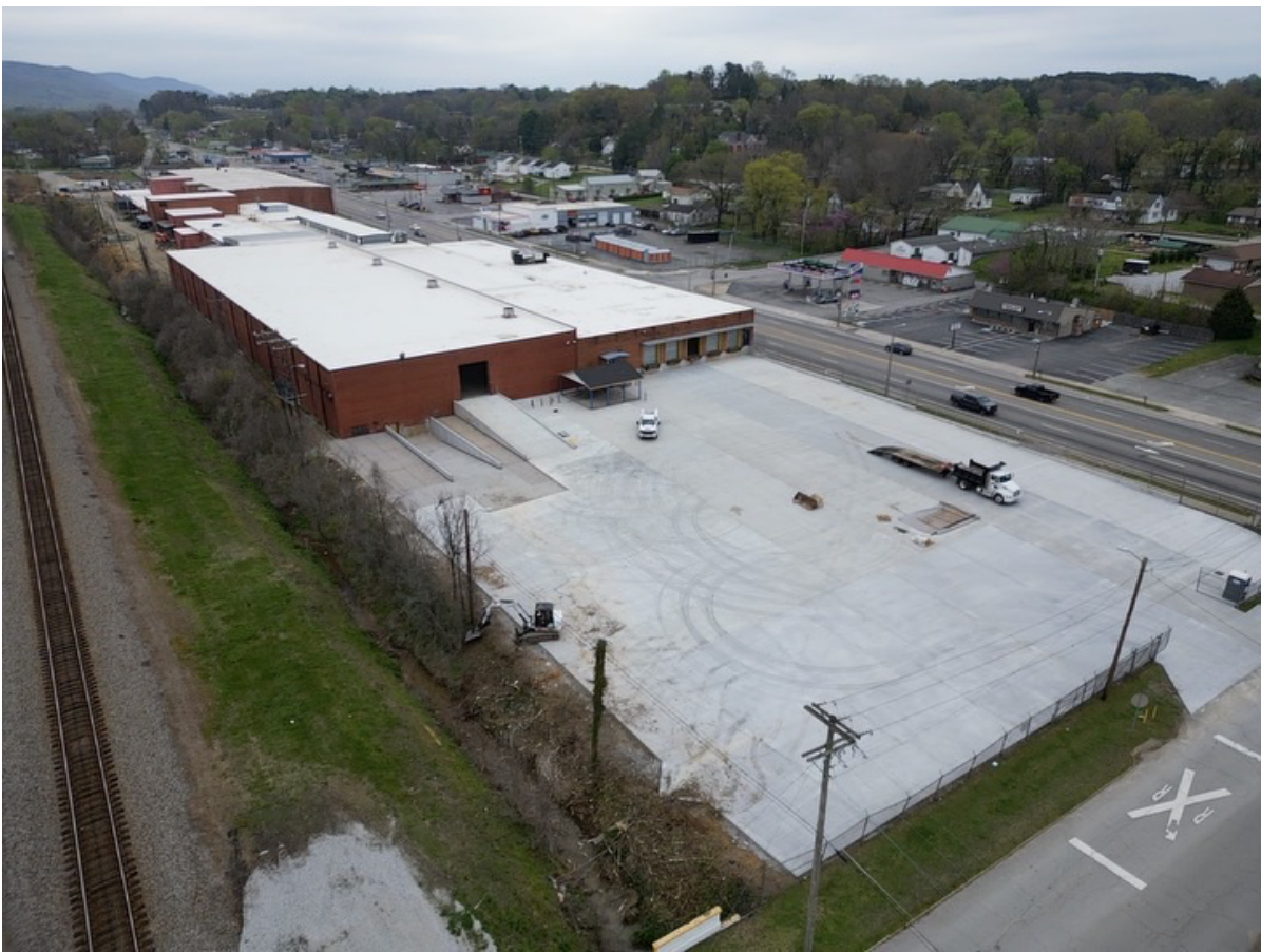
Protomet expansion project site

Three Roots Capital partnered with Regions Bank to help finance Protomet Corporation 's new manufacturing facility in Rockwood, Tennessee. This $25 million expansion will create 250 new jobs and retain 150 existing positions. Protomet, a precision engineering and manufacturing company based in Loudon, is transforming a former Albahealth building into a 250,000-square-foot, state-of-the-art production center. The new facility will enable the company to increase capacity, support new product lines, and strengthen relationships with customers in the boating, automotive, and homeland security industries.